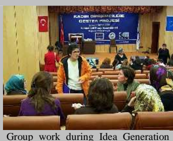
Group work during Idea Generation