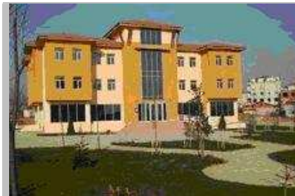
Fevziçakmak Mh. Erzincan Cd. No:98 (Fevzi Çakmak Bölge Parkı Karşısı), Pendik/ İstanbul