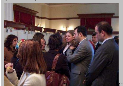
Coffee break discussion with Members of Turkish Parliament