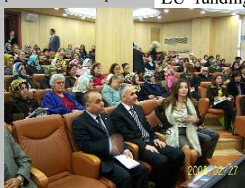
InfoDays Pendik: Member of Parliament (R), Mayor of Pendik (M) and head of Finance & Contracts Unit